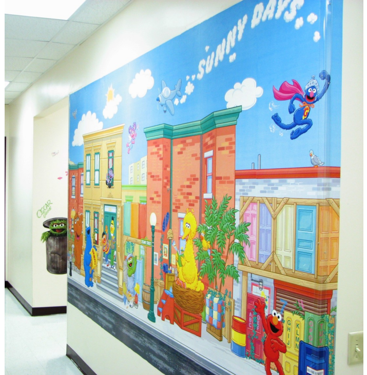
The WIC area in Franklin County has a great new and inviting look.

Now, support staff members greet clients, who still enter the first floor clinic area, and escort them to the new WIC/Nutrition area by stairway or elevator.