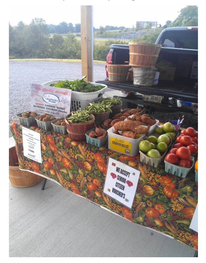
Lincoln County Market

The Northern Kentucky and Harrison County Health Departments provided assistance by giving food instruments (FIs) to eligible WIC participants at their market locations. Staff encouraged participants to use their FIs while they were at the market. On more than one occasion, markets were set up in local health departments' parking lots. The health