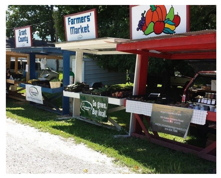
Grant County Market

department staff would also make phone calls to remind participants to use their food instruments (FIs) by the expiration date.