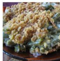
Grandma's Green Bean Casserole

Cooking and Seasoning: Put them on the stove and start cooking. Add salt, pepper, and a bit of chopped onion. Green beans take a lot of salt to taste good. So salt them generously. Unless you want vegetarian beans, add the bacon grease from about 6 strips of bacon to the pot of beans while they cook. Cooking the beans with a piece of ham works even better for seasoning green beans. Green beans take about two hours to cook so start early and give them plenty of time. Cook the beans uncovered on medium heat until very tender and add more salt and pepper according to taste. They cook up a bit and you will need to make sure they don't get dry by adding more water as needed.