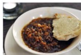
French Onion Soup

In a sauté pan over medium heat add oil, heat and add onions and salt. Cook the onions until they are caramelized, about 20 minutes. Remove from heat and set aside to cool. Mix the rest of the ingredients and then add the cooled onions. Refrigerate and stir again before serving.