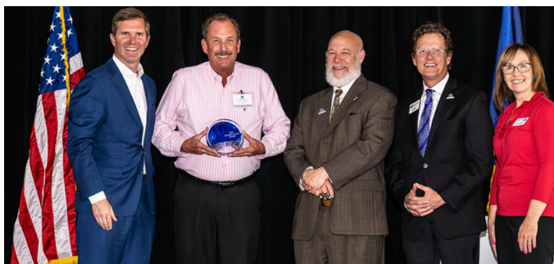
Above: Dutch's Chevrolet of Mount Sterling honored. Below: Stuttgart Motors of Lexington honored.

Thank you Dutch's Chevrolet and Stuttgart Motors for educating and supporting foster youth!